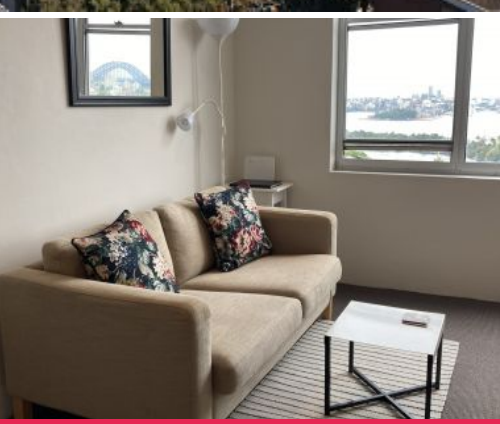
84/43 Musgrave Street Mosman, NSW